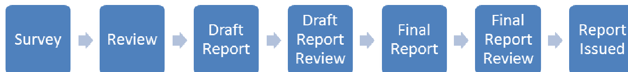
Figure 2 Process Overview

The WP5 survey and WP5 conference call review were completed during early February 2011. The D5.3.1 & 2 „Guidelines for Use“ report will be issued at the end of March 2011. The report will contribute to the following initiatives: